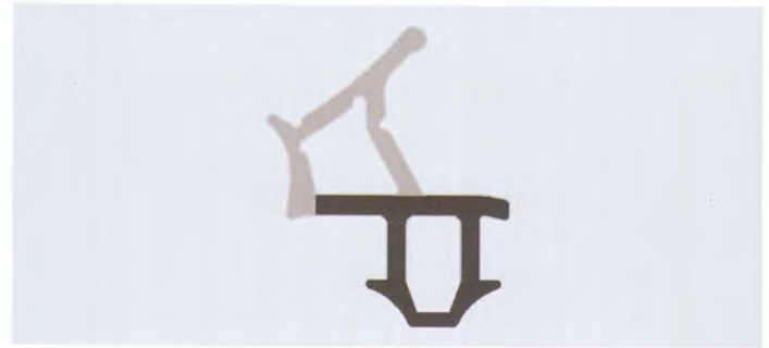
3000 zendow MULTIFUNCTIONAL WEATHERSEAL

The 3000 zendow multi-functional weatherseal is at the cutting edge of modern design and material technology. Manufactured from high performance thermoplastic elastomers, the unique design and incorporated features ensure unrivalled weather performance. The new weatherseal is welded at the corners, providing an all-round seal, further improving the insulating properties of the product. This ingenious design enables a significant reduction in the everyday strain placed on the hardware, which in turn increases the lifespan of the window.