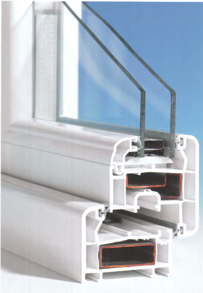
CROSS SECTION OF 3000 zendow WINDOW

BS EN 12567-1:2000 (thermal performance, windows and doors)